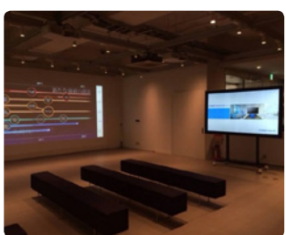
Corporate - Meeting room

Location: Microsoft, Korea Product: 84" Interactive Board Application: Briefing and Meeting