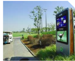
Golf Club Location : Incheon, Korea Product : 46" Dual Outdoor Display Application : Advertisement Screen