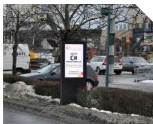
Parking lot Location : Stockholm, Sweden Product : 46" Outdoor Display Application : Advertisement Screen