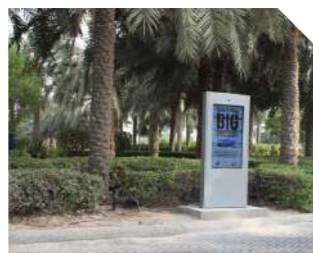
Resort Location : Dubai, U.A.E Product : 46" Outdoor Display Application : Advertisement Screen