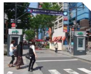
Entrance of Subway Location : Shinjuku, Japan Product : 46" Outdoor Display Application : Advertisement Screen