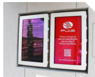
Shopping Mall Location : Oslo, Norway Product : 46" Outdoor Display Application : Info & AD Screen