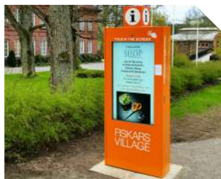
Village Location : Fiskars Village, Finland Product : 55" Outdoor Display (Dual) Application : Info & AD Screen