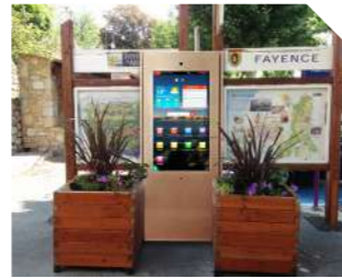
Restaurant Location : Saint-Baume, France Product : 46" Outdoor Display Application : Info & AD Screen