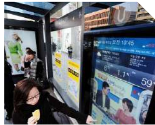
Bus shelter Location : Seoul, Korea Product : 46" Outdoor Display Application : Info & AD Screen