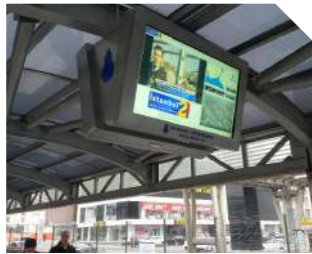
Bus shelter Location : Istanbul, Turkey Product : 46"/55" Outdoor Display Application : Info & AD Screen