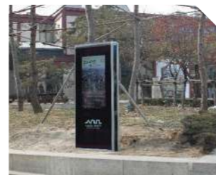
Museum Location : Seoul, Korea Product : 46" Outdoor Display Application : Info & AD Screen