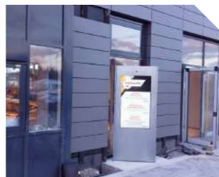
Office Location : Illerkirchberg, Germany Product : 55" Outdoor Display Application : Info & AD Screen