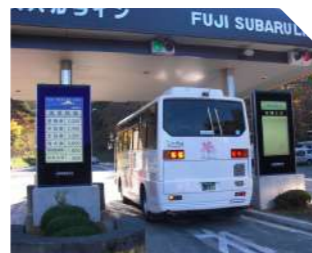
Toll gate Location : Fuji Subaru Line, Japan Product : 70" Outdoor Display Application : Information Screen